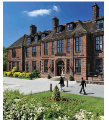
The Venn Building, Hull Campus