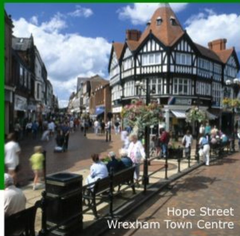
Hope Street Wrexham Town Centre

The Steeple of St Giles' is one of the Seven Wonders of Wales