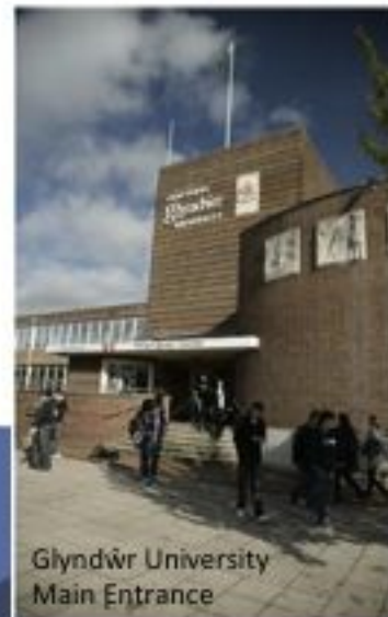
Glyndŵr University Main Entrance