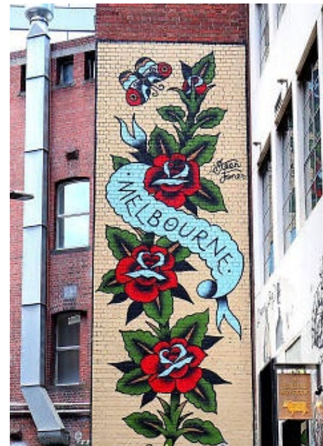
Duckboard Place , Melbourne, Victoria, 3000

Did you know Melbourne is famous for its street art? The University of Melbourne even has a subject called Street Art which allows students to explore and learn about the street art in Melbourne's laneways.