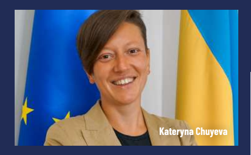
11:30AM-1PM "WHAT CAN MUSEUMS DO IN THE FACE OF WAR?"

Cooperation between museums in Ukraine and a number of European countries was decisive in saving and preserving the artworks of Ukrainian museum institutions as well as in opening a new space for teams to work and collaborate. The initiatives were multiplied and the collaborative network was enhanced. In the context of a war that is unfolding on the longer term, what are the needs of Ukrainian museums today? What resources can European establishments mobilise to answer these needs? More broadly, what responsibility do they face when, on European soil, museums and the heritage they enclose become subject to such threats?