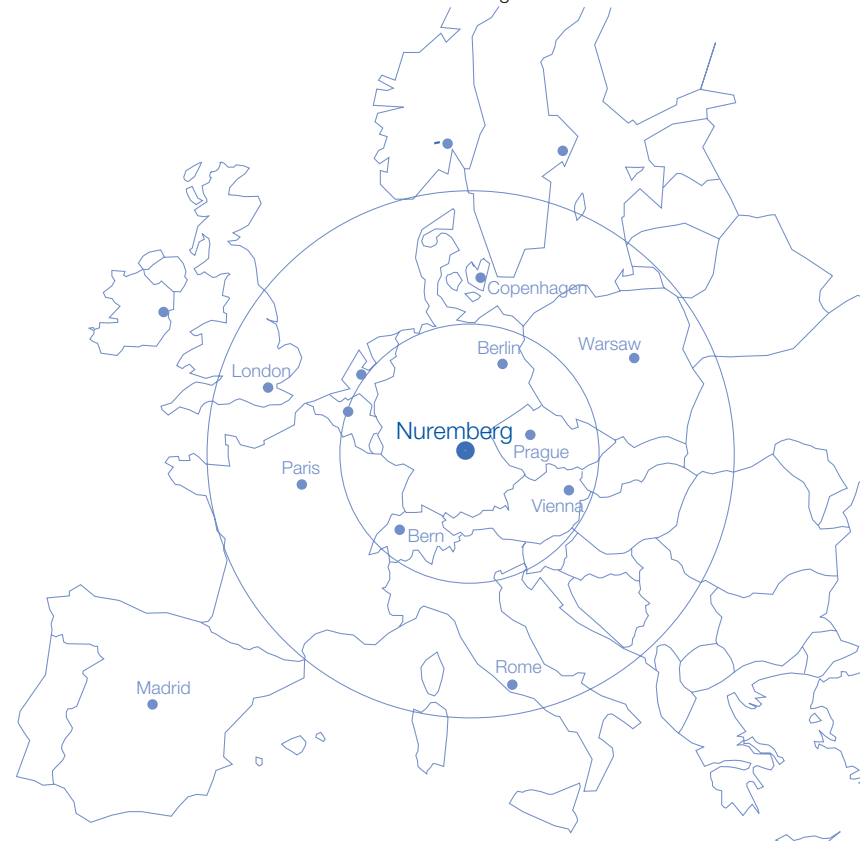
Dezember 2021