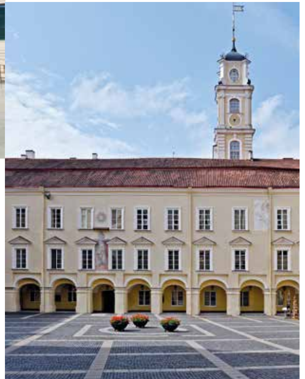
HINC ITUR AD ASTRA