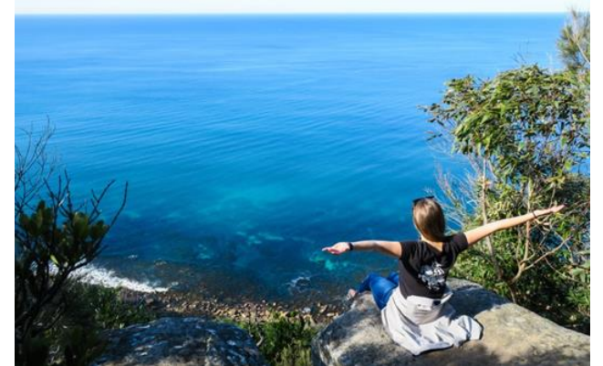
Royal National Park, Australia