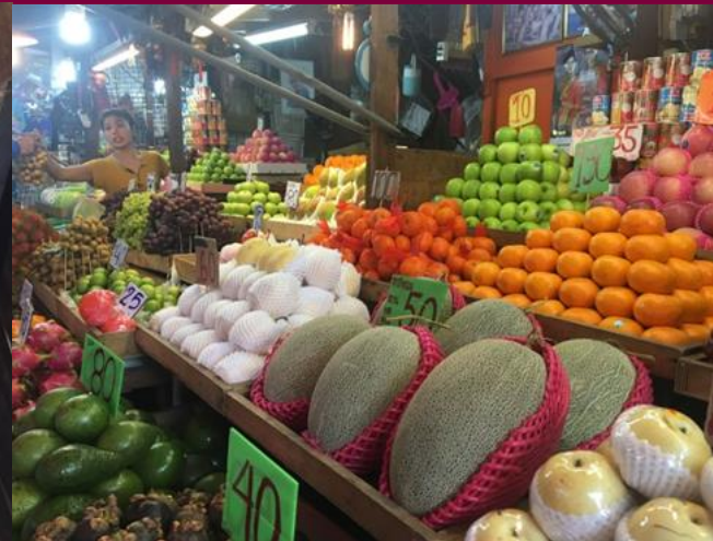
Noisy market in Thailand