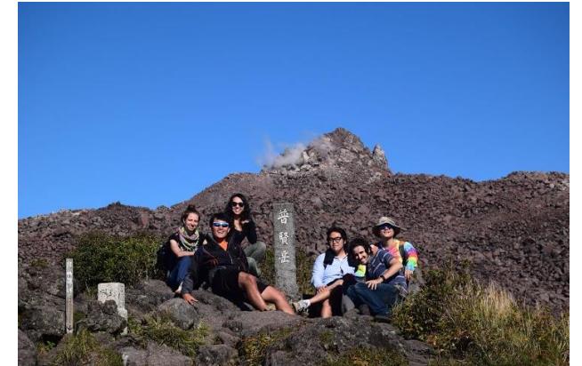
Mt. Unzen, Japan