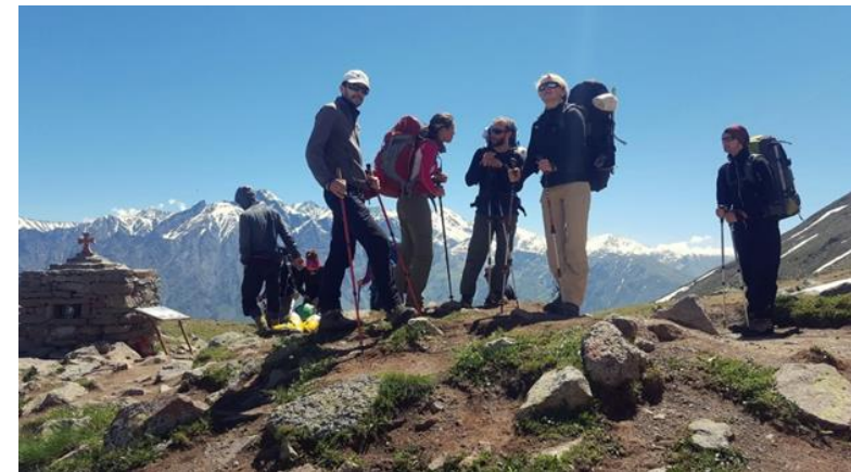
Joys and struggles in the mountains of Georgia