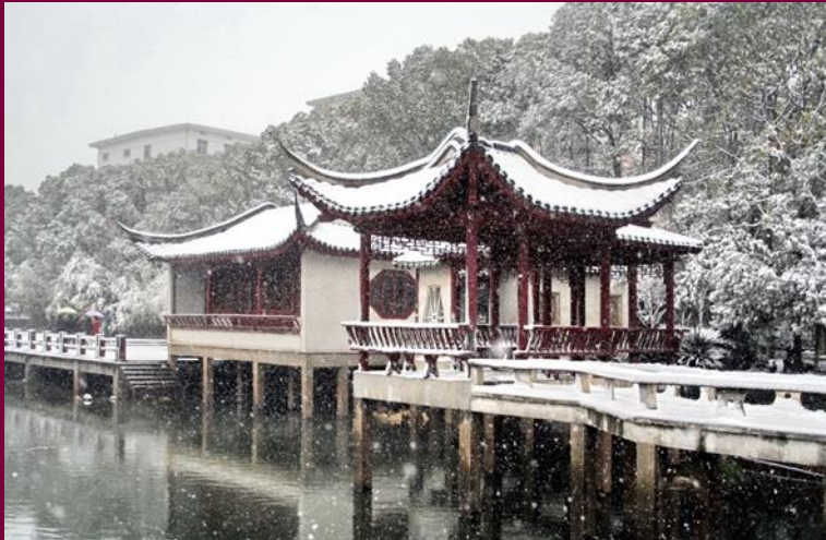
Jiao Lake, China