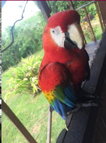
In the Amazonian Jungles, Columbia