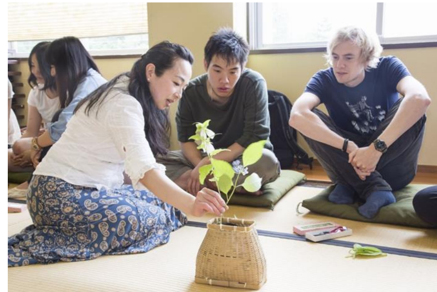
Flower arrangement (Ikebana) in Japan

www.vu.lt → Tarptautiniai ryšiai → Mainų galimybės → Dvišalės sutartys