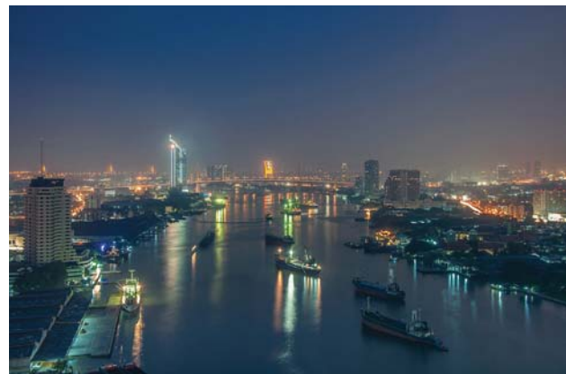
Chaophraya River, Bangkok

Our experience in organizing Summer Universities taught us, that our participants want some free time for shopping at the end of the program. Well, the conditions are great: We are in Bangkok, and there we have some of the best shopping centers in Asia. Enjoy!