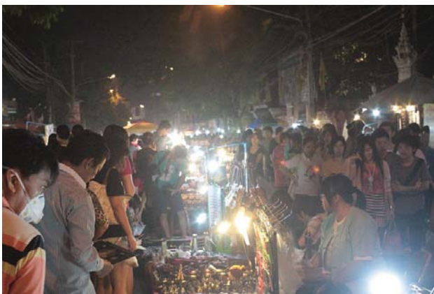
Chiang Mai Night Market

After the company visit, you will go back to Bangkok on a wooden boat along the shores of Chaophraya River, especially impressive when darkness falls.