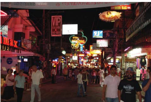
Pattaya at night

You can opt for some tanning sessions (take a good high-factor sun protection all the time!), enjoy a Thai Massage, rent a boat for a tour around the island, ride the banana or a jet-ski (all at your own expense). In this fine and white sand, playing beach ball or beach volleyball is sheer fun for those who need some tougher action.